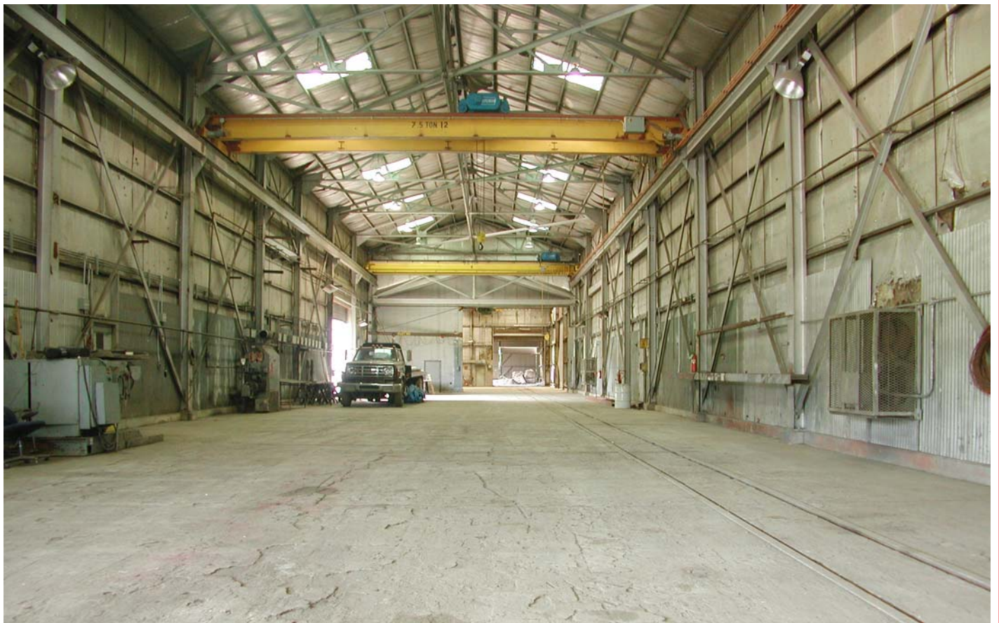
PAINT SHOP LOOKING IN OPPOSITE DIRECTION (TWO 7.5 TON CRANES)