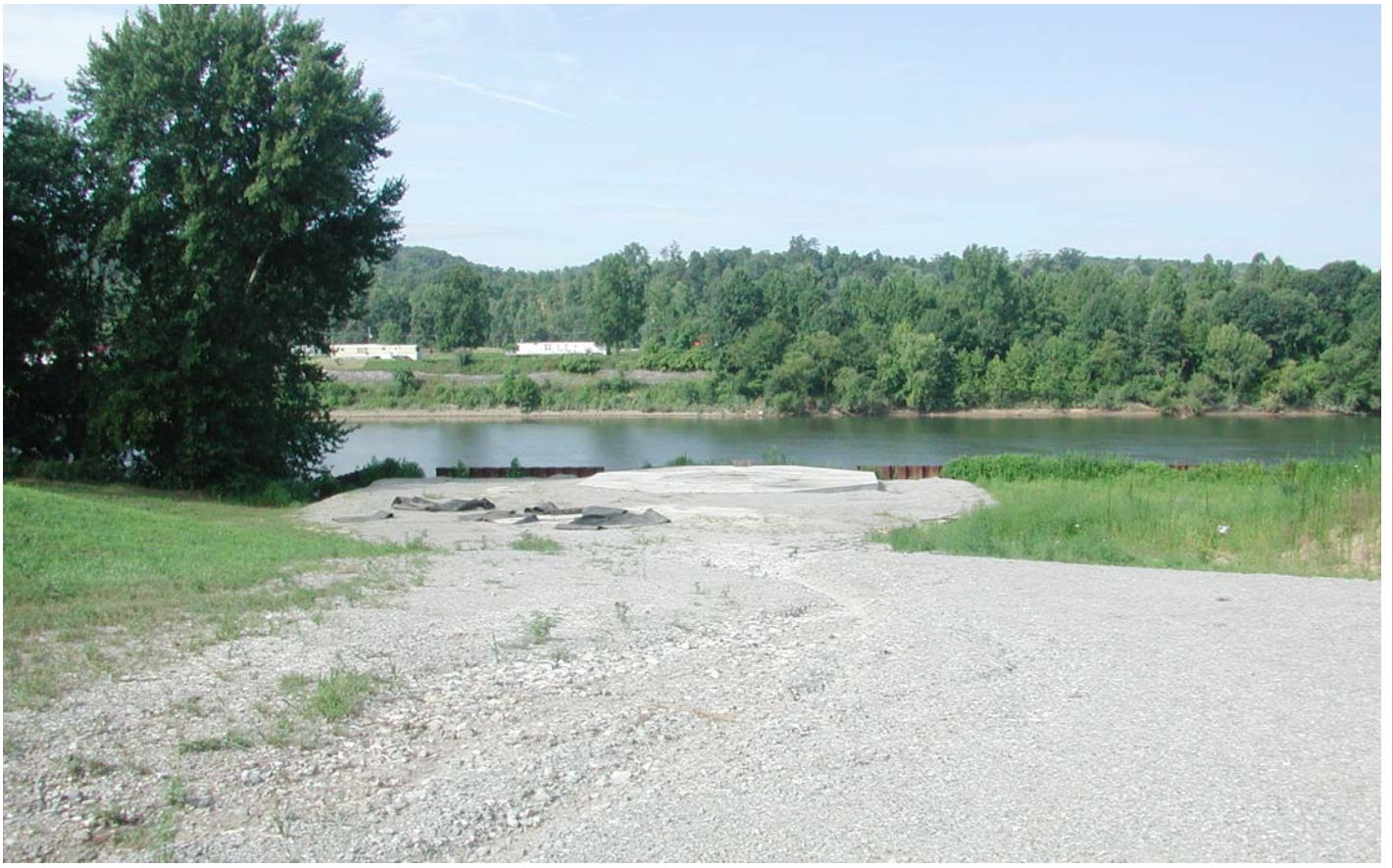
BARGE FACILITY SHOWING CRANE PAD