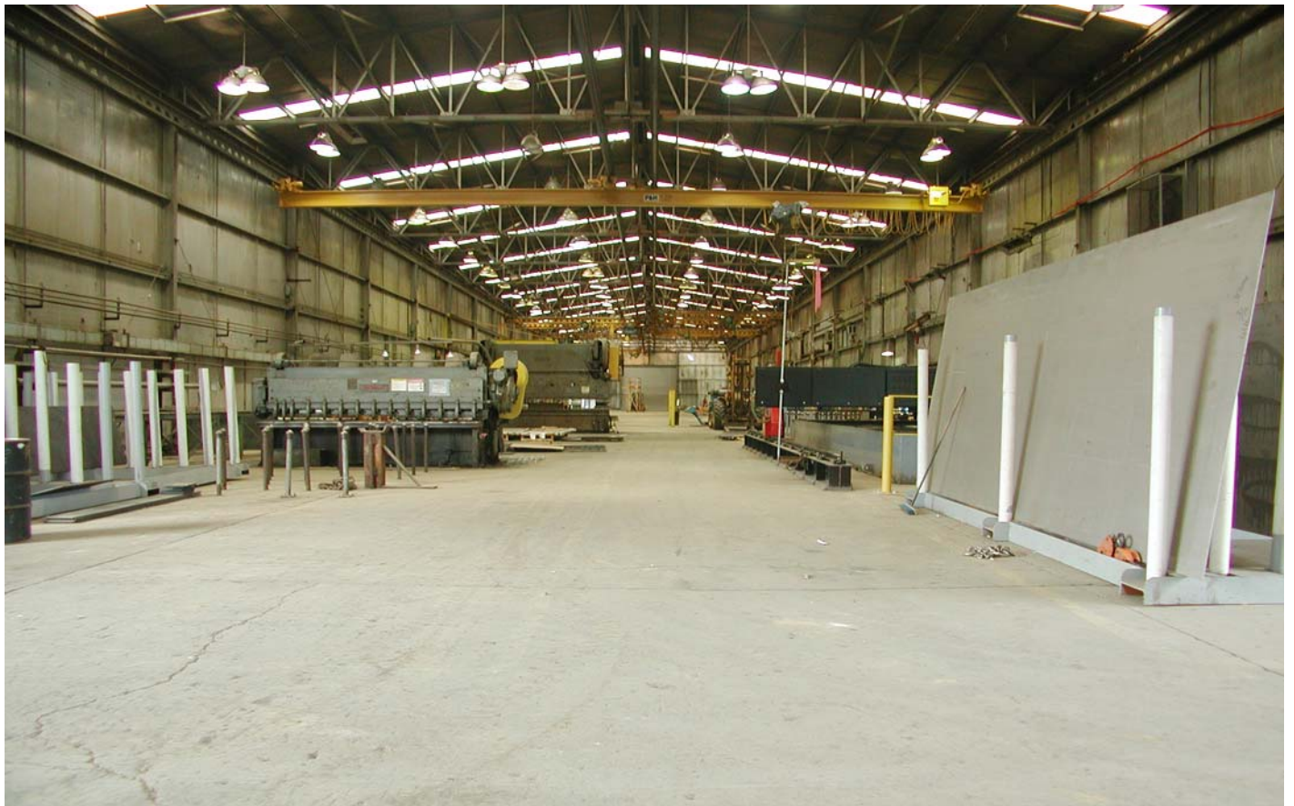
MAIN SHOP LOOKING IN OPPOSITE DIRECTION