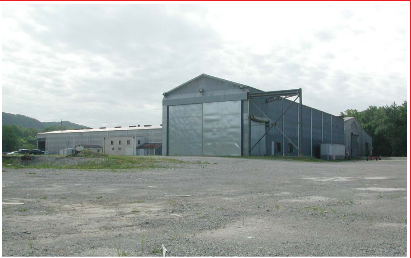
PAINT SHOP SHOWING LARGE SLIDING DOORS