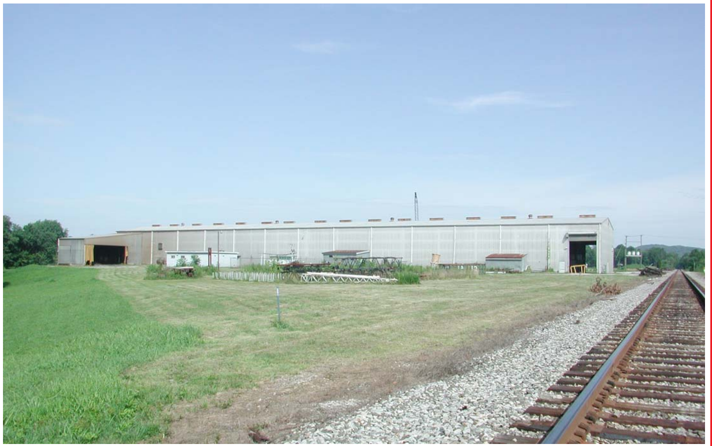
REAR OF BUILDING, RAIL SIDING FEASIBLE