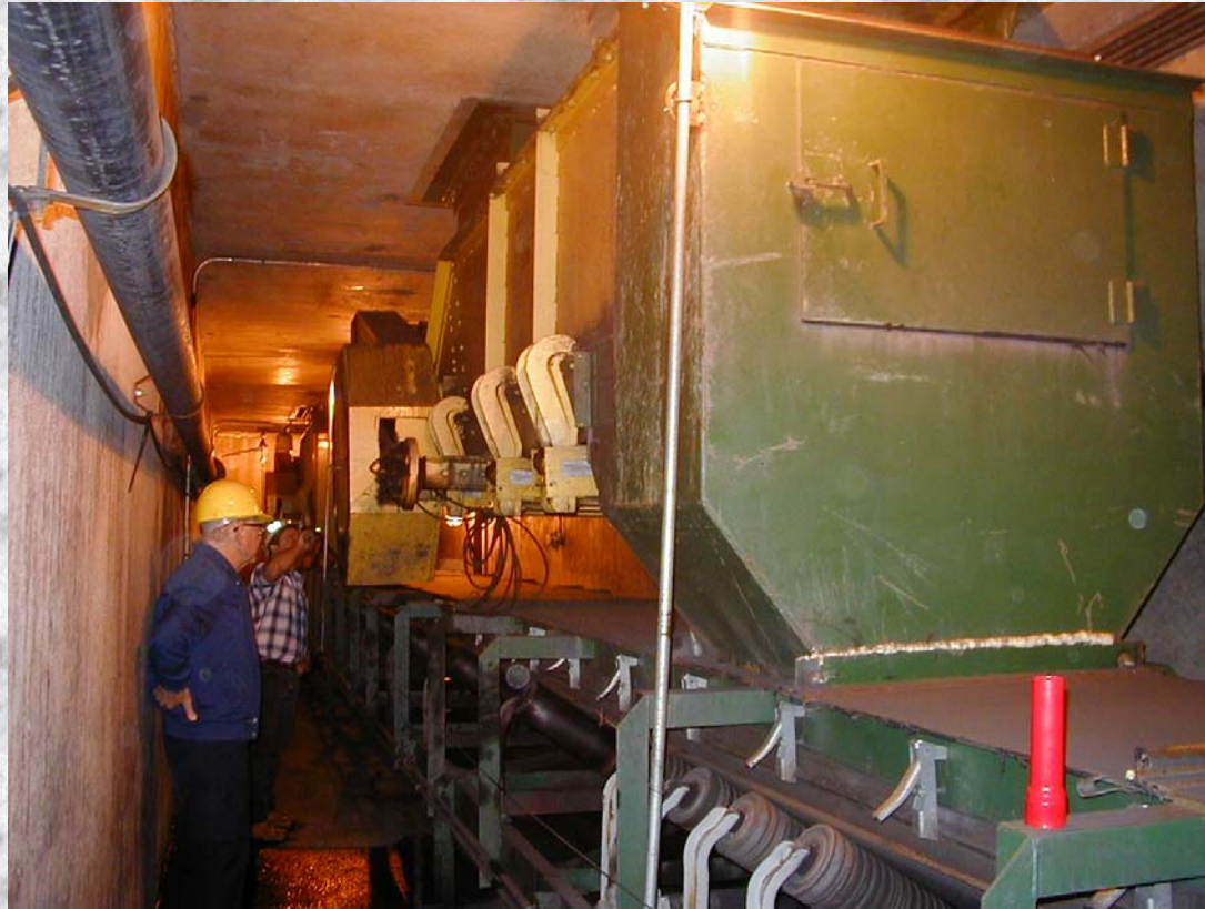
Three In Line Feeders